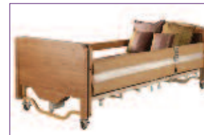
Side rail pads