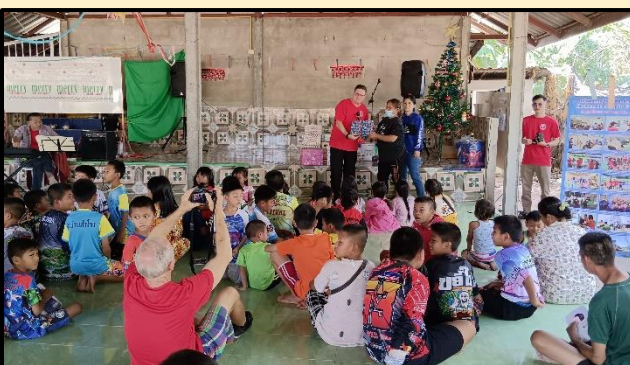
Villagers received Christmas gifts.