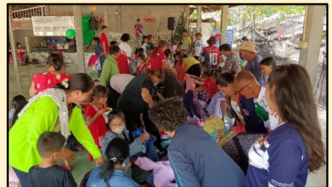
Adults were given donated clothing.