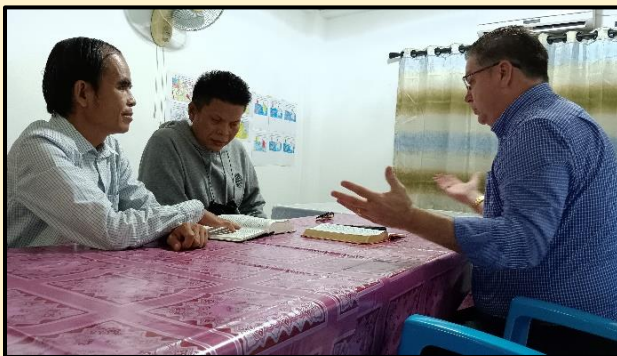
Explaining to Por before he received Jesus. (Dec. 3)