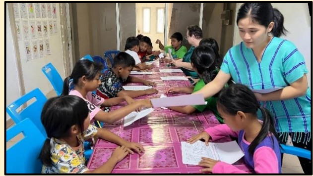
Now we have 12 children come to church regularly.