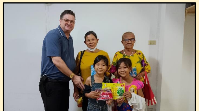
Other visitors are interested in believing in Jesus.