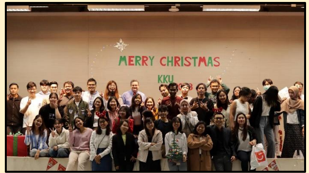
This is the 2 nd year here. Many want to know Jesus.