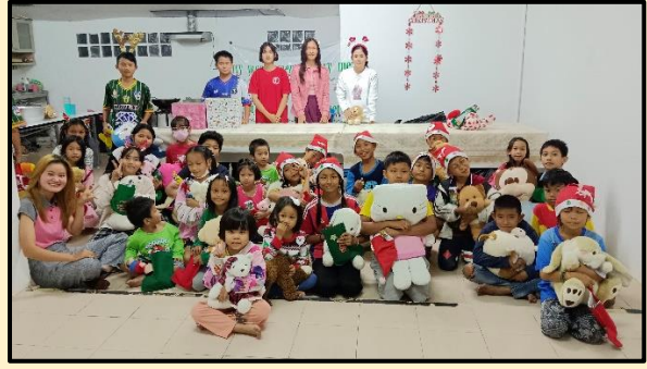
Children and adults are happy to receive gifts.