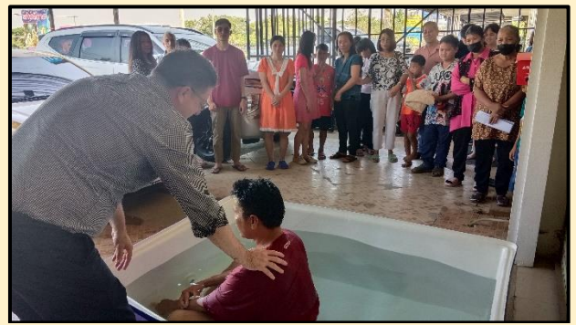
Por was baptized on the following Sunday. (Dec. 10)