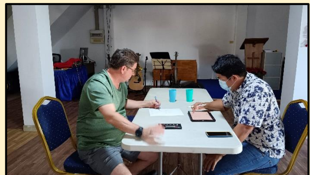
Preparing a new church plan for the right time.