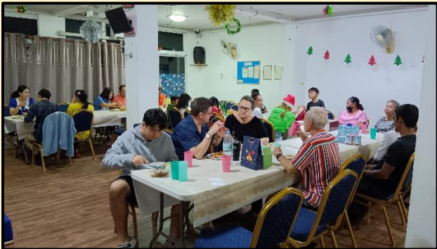
We enjoyed eating and talking together. (Dec.30)