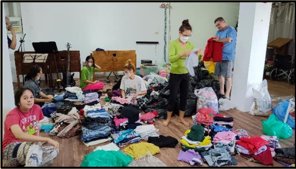
We prepared clothes and gifts for the 2 outreaches.