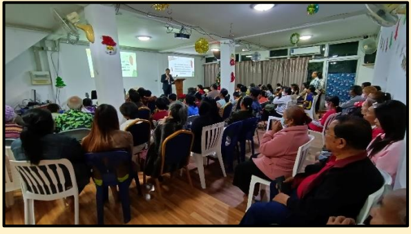
About 20 people received Jesus before candlelight.