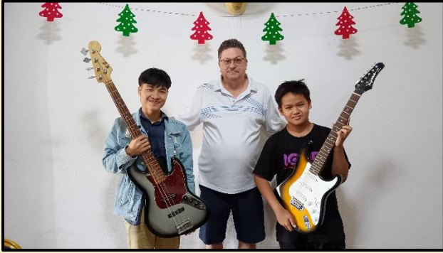
New bass and electric guitar for the worship team.