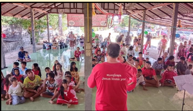
Villagers heard the Good News and received gifts.