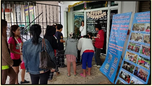
Visitors signed in and then had dinner.