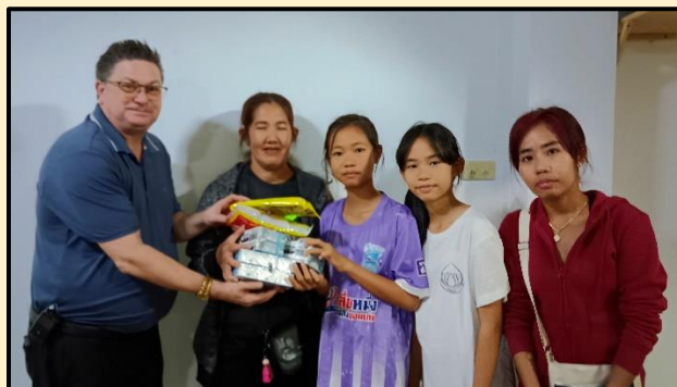
These 4 Christians want to be our members.