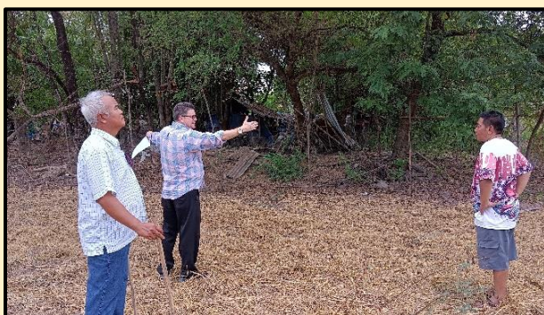
God has led us to a great piece of land.