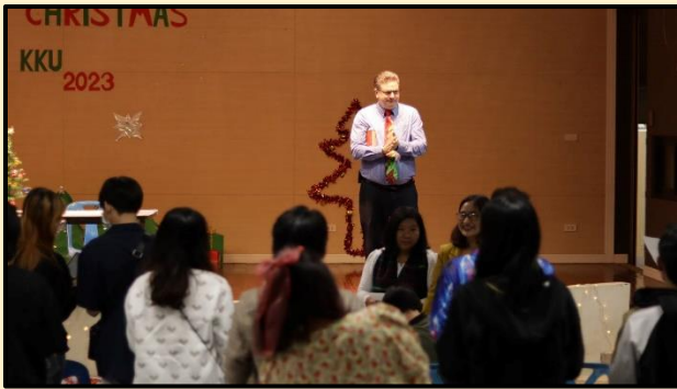
Sharing the Good News at Khon Kaen University.