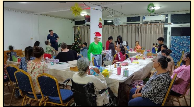
Exchanging gifts was full of fun and good memories.