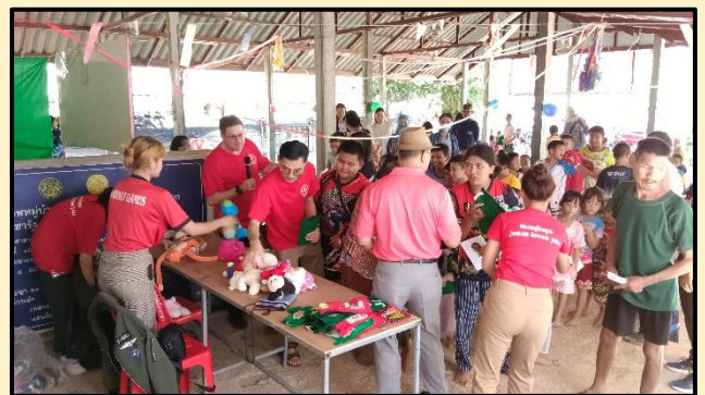
Children received stockings and stuffed animals.