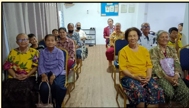
8 visitors from Dec. 16 and 12 visitors from Dec. 23.