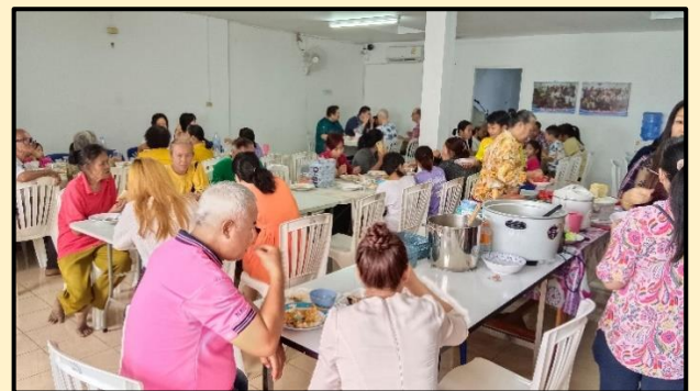
57 people on Dec. 31 st (The highest of the year.)