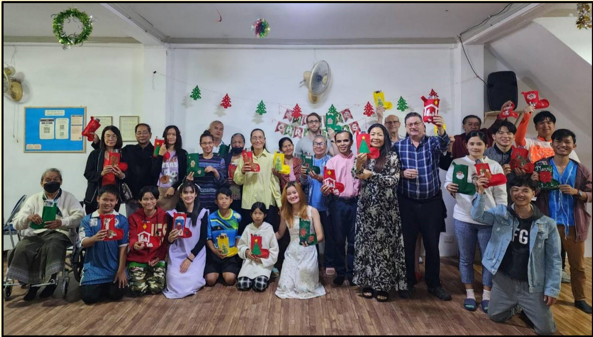
Christmas Outreach on Dec. 16

SIBC VISION: LOVE GOD, LOVE THE CHURCH AND LOVE OTHERS