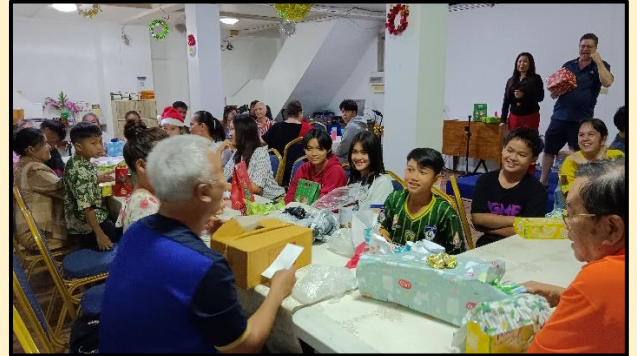
All members were happy to get gifts from the pastor.