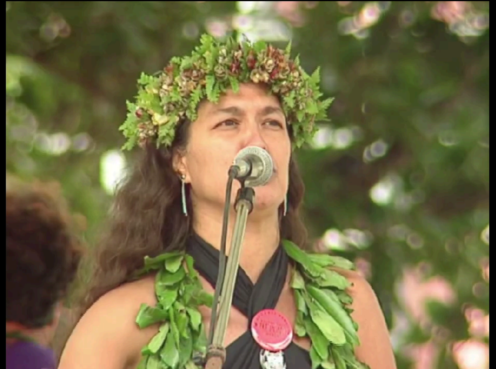
Still of footage used from Dr. Haunani-Kay Trask's 1993 Address typically referred to as 'We Are Not American'