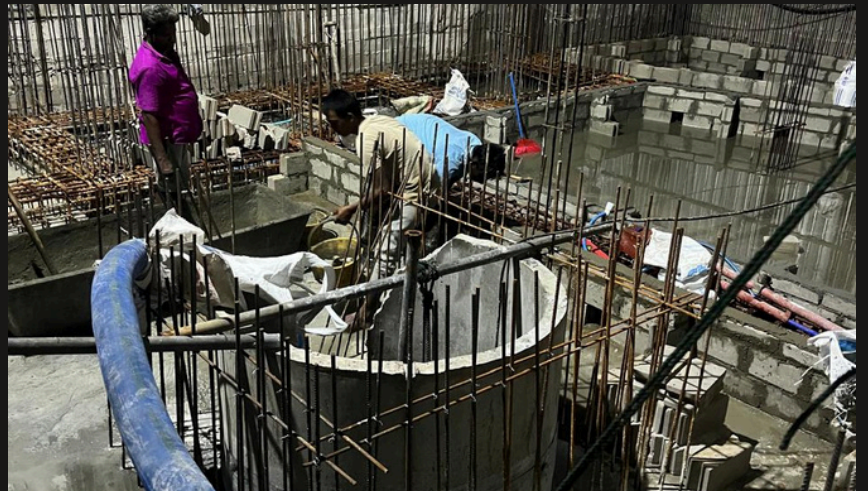
KASHMEER GARDEN HULHANGUBAI WORKS