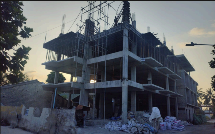
HEVILA GUESTHOUSE PROJECT WORKS