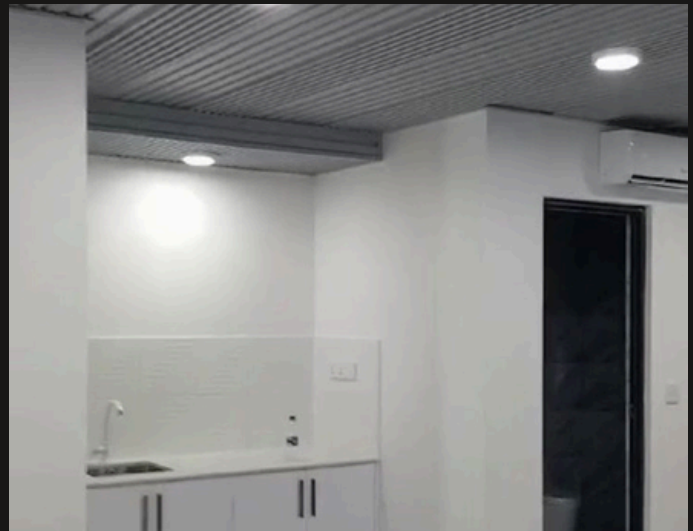
KASHMEER GARDEN 2ND FLOOR