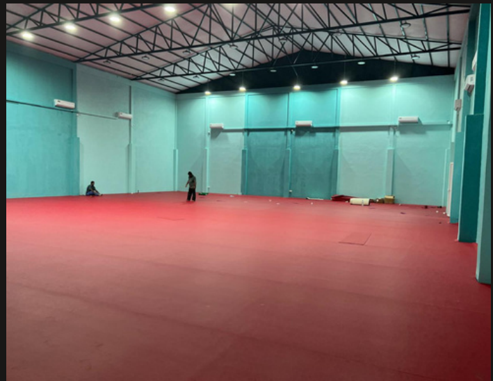
TABLE TENNIS ASSOCIATION FLOORING WORKS COMPLETED