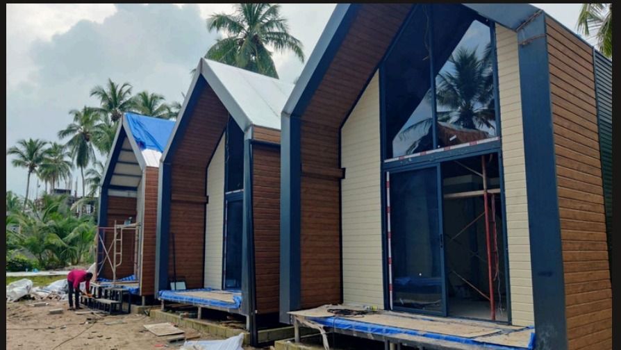
AMBRA GUESTHOUSE PROJECT WORKS