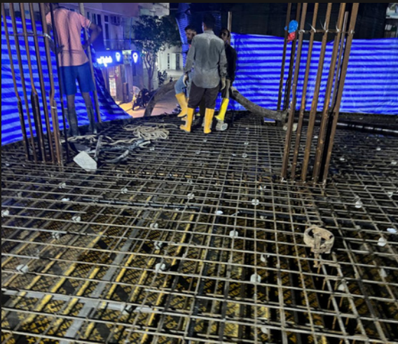
KASHMEER GARDEN HULHANGUBAI WORKS