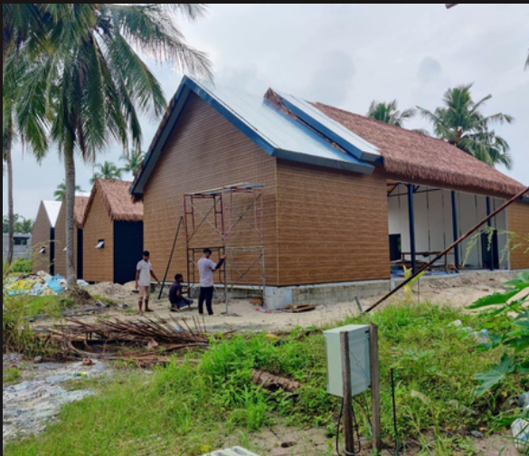
AMBRA GUESTHOUSE PROJECT WORKS