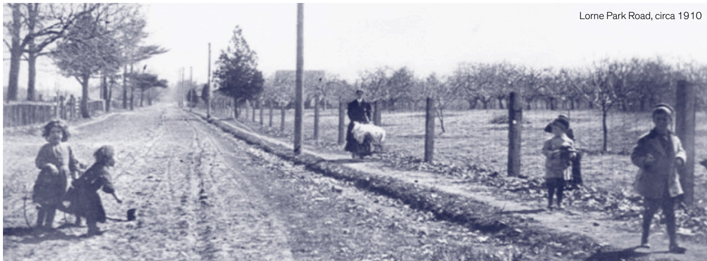
Lorne Park Road, circa 1910

Newsletter of the Mississauga South Historical Society