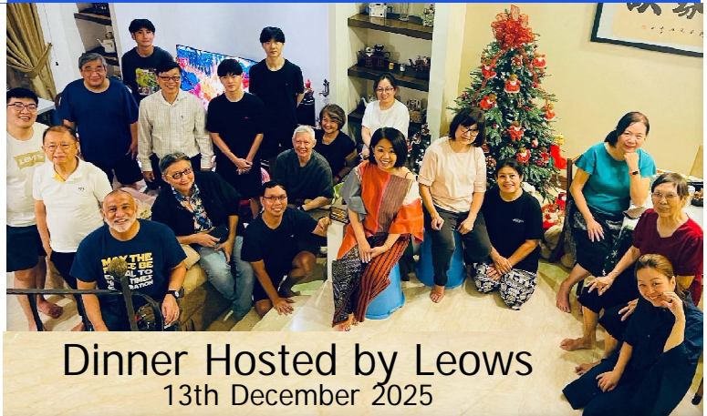
Dinner Hosted by Leows 13th December 2025