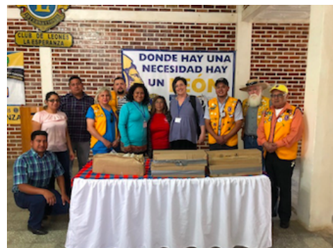
THE LA ESPERANZA LIONS CLUB DENTAL AND EYE CLINICS

For twenty-one years, MMA has sent orthopedic teams to work in the La Esperanza public hospital. Our long-time volunteers--orthopedists, anesthesiologists, PA's, circulating nurses and surgical technicians--have formed strong working ties with the hospital staff, and with the thousand of people who have been treated to these often life-changing surgeries. We've also sent an ophthalmologist, an ENT, a radiologist, and a urologist--and dedicated, oft-returning, OB-GYN's.