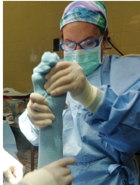
SPECIALISTS IN THE HOSPITAL

Sometimes it just starts with a grant to a community group for a corn mill. The group gets business training from the county, and on-going training and support from Save the Children--Honduras. With money earned from the mill, the group might buy seed potatoes. The next year, MMA might help with fertilizer costs, or a small pump for irrigation. After a few years