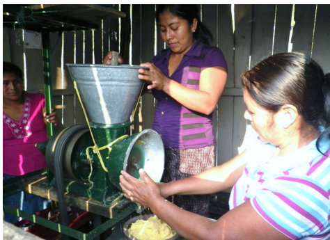
HELPING COMMUNITIES PROSPER

We partner with a private school in Siguatepeque that feeds more than 100 students from poor families for just $11.50 a month per child. The school provides the teachers, the space, the cooks, and the medical care for these kids. Your donations buy the food.