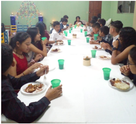
PRODIM-BETHEL, Siguatepeque, Honduras