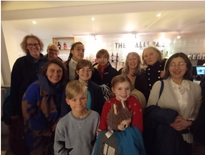
A delightfully multigenerational trip to the pantomime to see Sleeping Beauty at the Arts Theatre.