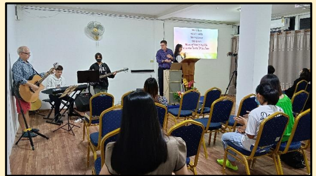
We worship God with love, joy and thanksgiving.