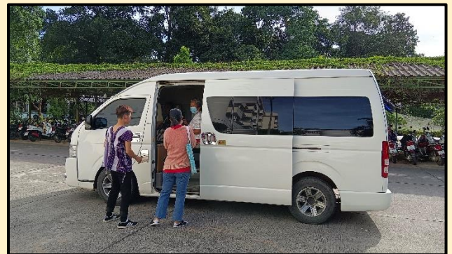
Picking up Myanmar members from KK University.