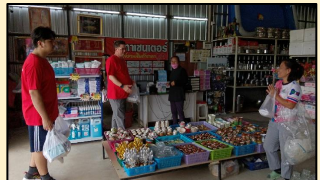
We got to know more neighbors near our church.