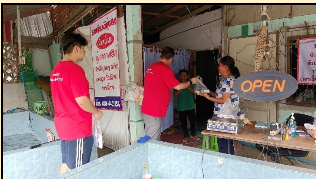
We learned to also take the church to the people.