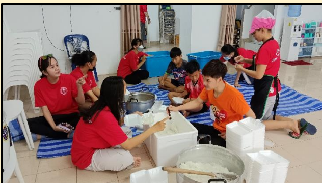
We prepared food for 300 people like every time.