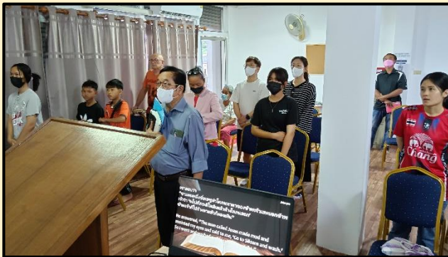
We love to read and listen to God's Word on Sunday.