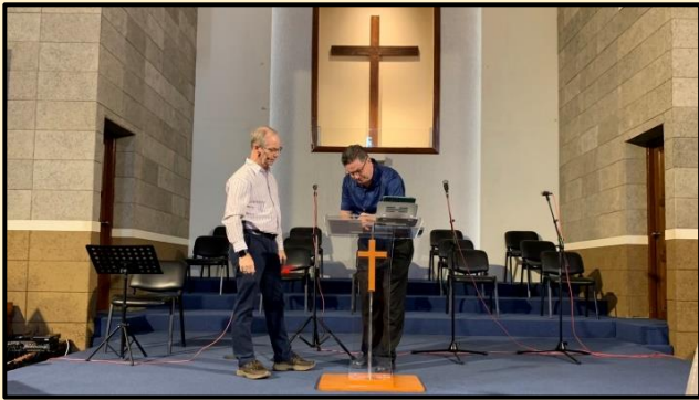
Signing contract with Calvary International Baptist Church in Bangkok. (Sunday 9 October)