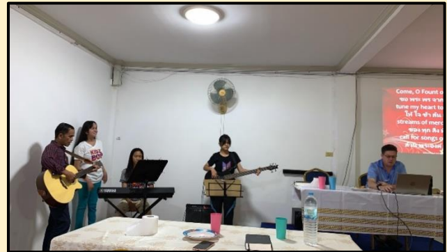
Our youths play a new song every Wednesday night.