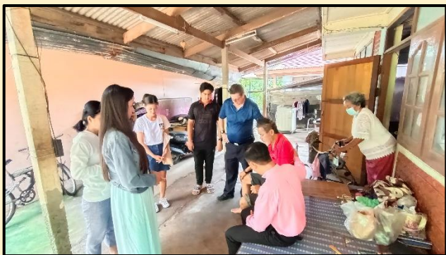
Visiting our sick musician and his mother.