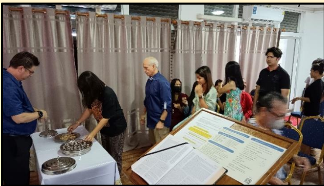
We take the Lord's Supper to remember Christ's love.