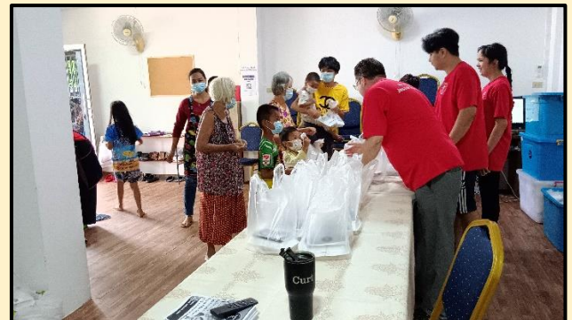
Almost 100 people came to get food at our church.