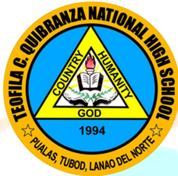
Figure 5. Teofila C. Quibranza National High School Contemporary Logo

The Teofila C. Quibranza National High School celebrated its 39th foundation day on March 8, 2024. The foundation day is the birth date of the late Teofila C. Quibranza, who donated the land. On this day, March 8, 2024, the school celebrated her 107th birthday at the Mausoleum as a yearly tradition in honor of her significant contribution.