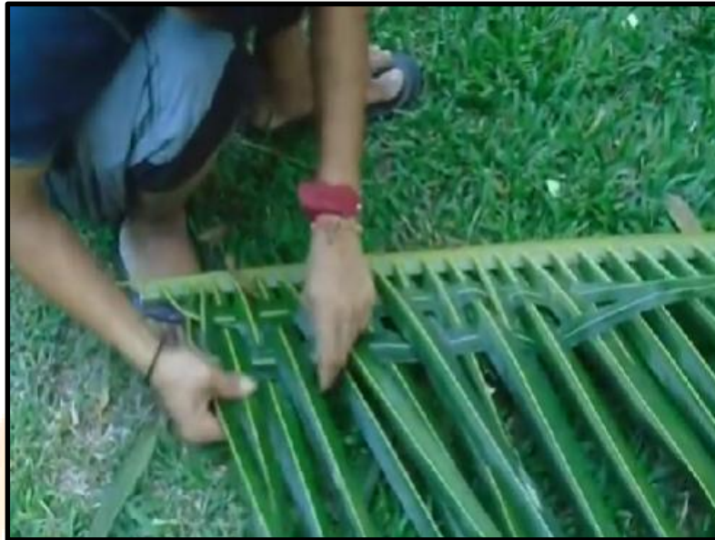
Figure 4. A screenshot of a video on how to make a sulirap.

Using nipa and bamboo sticks for construction, the school first used one room on the site to serve as both a stage and a classroom during the 1986–1987 academic year. The third-year level was subsequently implemented by the school for the 1987–1988 academic year.