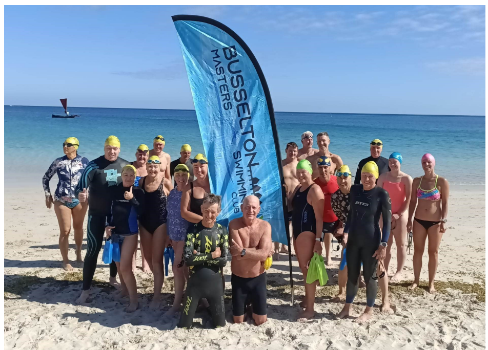
Ocean Swim from King Street Saturday 10th December 2022