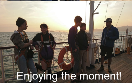
Enjoying the moment!