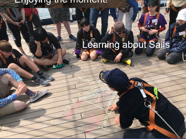
Learning about Sails