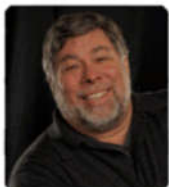
Steve Wozniak Co-founder, Apple Inc