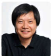
Jun Lei CEO, Xiaomi