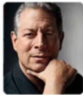
Al Gore 45th Vice President, the United States