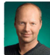
Sebastian Thrun Fouder, Google X