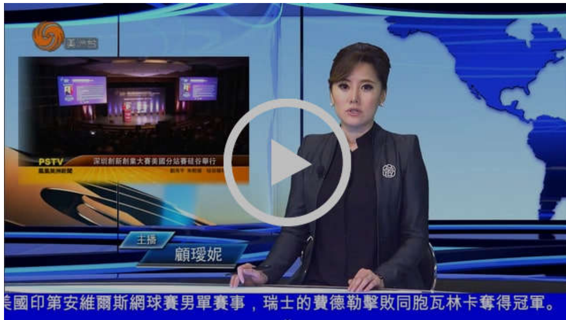
Report from Phoenix TV

Below is a quick photo review of the competition: