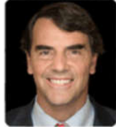
Timothy Draper Partner, DFJ