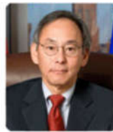
Steven Chu 12th Secretary of Energy, the United States