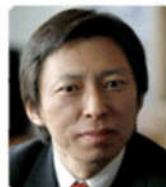
Charles Zhang CEO, Sohu Inc