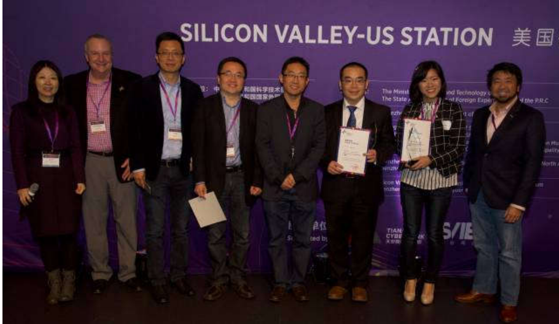
Top 6, guests speakers and judges

Besides, two winners of the second place went to ZLD Technology and Slietech; the third prize went to LeanFM, Dreamcatcher and PenguinSmart.