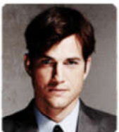
Ashton Kutcher Actor, Investor