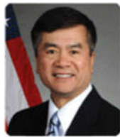
Gary F. Locke 10th Ambassador to China the United States