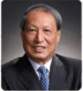
Siwei Cheng Former Vice Chairman, CPC of China