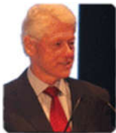
Bill Clinton 42nd President, the United States