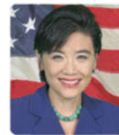
Judy Chu Congresswoman, the United States